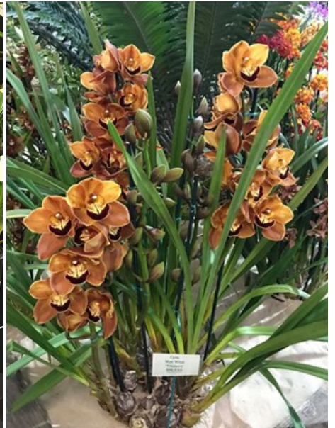
Mae West 'Tikitere'