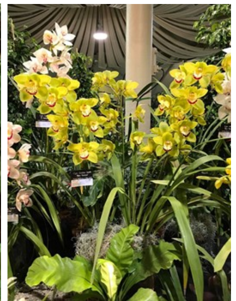
Golden Zenith 'New Horizon'