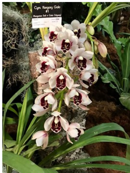
Hungary Gala '#1'