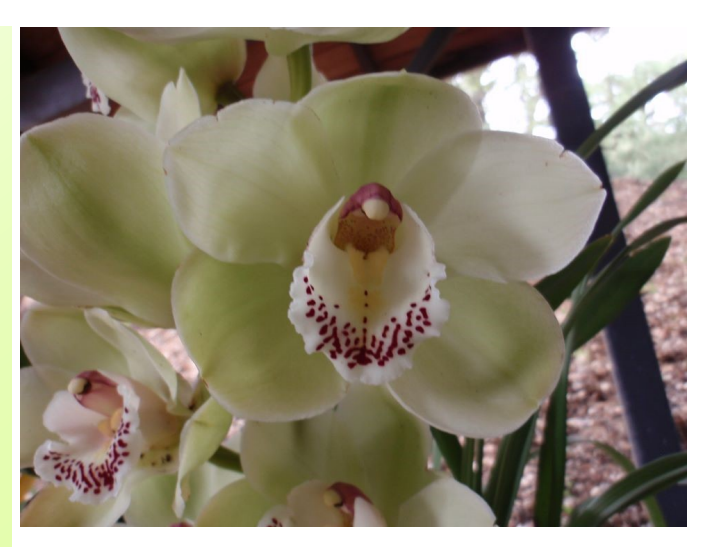
Cym. [(Green Spectacle x Conqueso) 'Scion' x Kimberley Valley 'Malibu')] Grower: W Caughlan

Welcome to edition 2 May 2020. A slight easing of restrictions has at least enabled us to catch up with family and friends, however it may still be sometime before we all feel comfortable about attending larger gatherings.