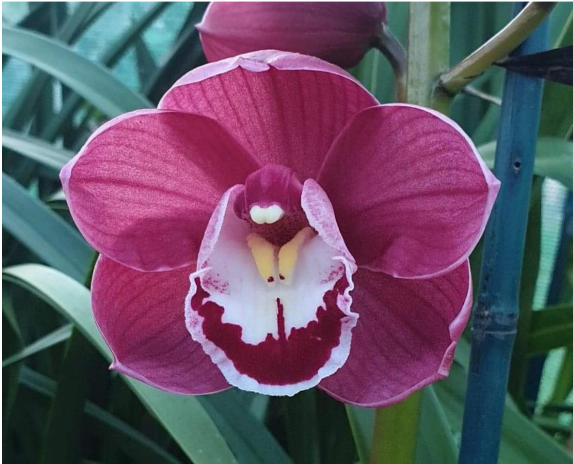
Olympic Flame 'Ai Tee' HCC/AOC

Even the older peloric Cymbidiums still demand that you part with big money!