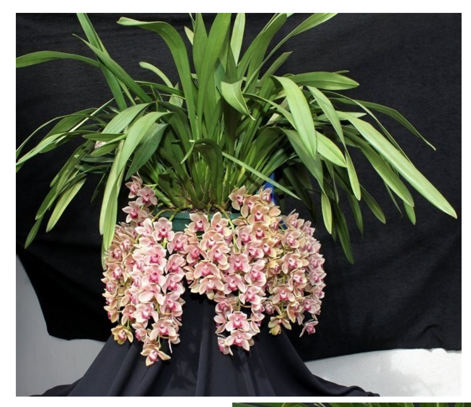
Cym Mary Green 'Showgirl' AM/AOC - 82 points 2017 Warringal Spring Show Exhibitors: F & J Spiteri

Cym Mary Green 'Devon' CC/OSCOV 2017 Bayside Spring Show Exhibitors: C & K Gillespie