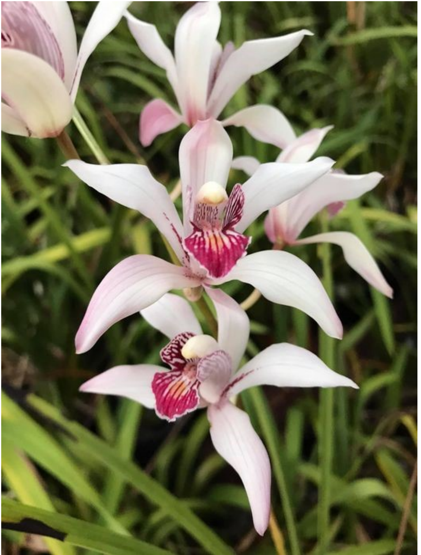
Blooming now (16/12/2020) is this Cymbidium seidenfadenii (Laos form). It is a very beautiful species. Photograph and grower Peter Alonso