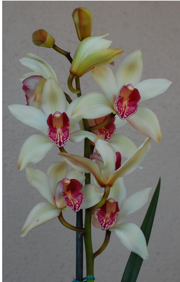
Cym Point Conception 'Bayview'