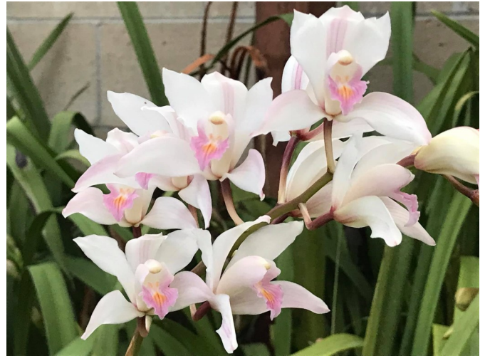
Cymbidium seidenfadenii 'Lyi'