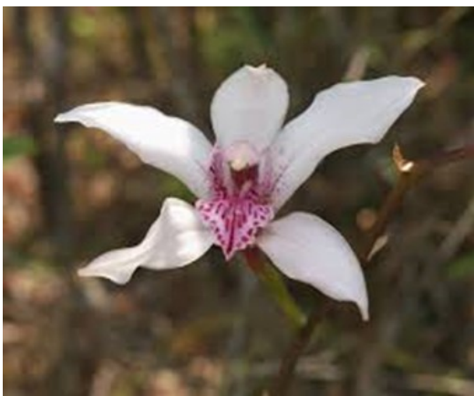
Some other flower forms of Cym seidenfadenii