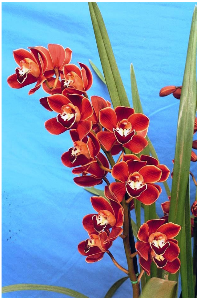
Cym. Red Pepper 'Paprika' (left) and 'Spice' (right).