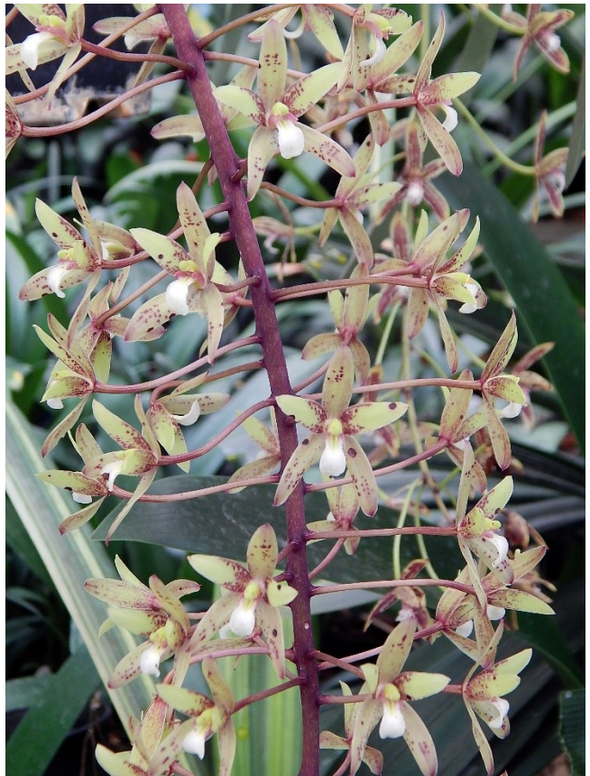
Cym. canaliculatum varies significantly in its markings. The two photos shown here are a very unusual form of the species that was discovered amongst a population of the sparkesii form. I had wondered if there might be some introgression from Cym. suave , but apparently this population is sufficiently isolated from the nearest known suave to exclude that possibility. It may be a rare mutant form that arose naturally.