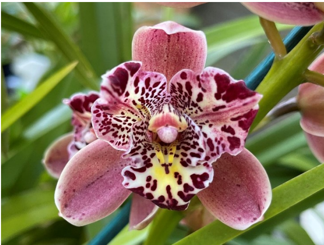
Cym. Strathdon 'Cooksbridge Fantasy'

pelorics. I have had success with one of them this year, Cym. Strathdon 'Cooksbridge Fantasy', but it's taken five years to produce a single spike.