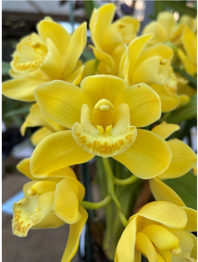
One of Teresa's many orchids, Cym. Pharaoh's Dream 'Dural'

I now live on the south coast of NSW where it's beautiful one day and magnificent the next.