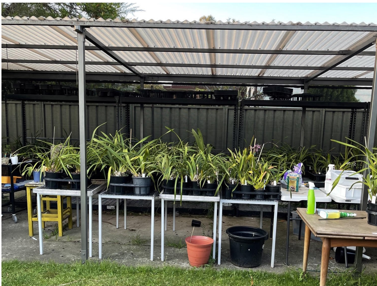
The majority of Teresa's Cymbidiums live under a Laserlite roof on mesh benches.

I live near the beach, just 90 minutes past Wollongong. The climate here is quite reasonable; we get frost from time to time but it isn't common for our region. The summers are quite hot. Unfortunately, I don't have a greenhouse or special microclimate – my orchids live under a