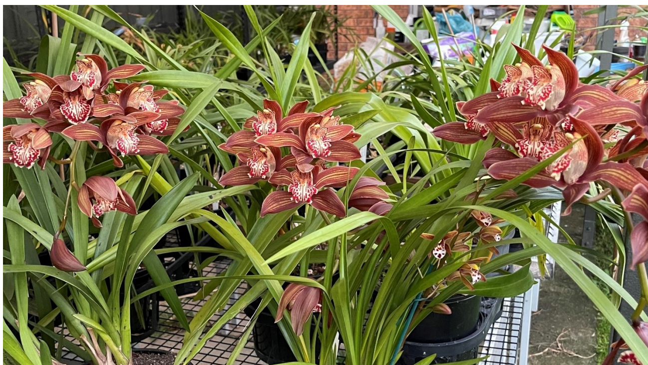
Cym. (It started with a Kiss 'Royale' x tracyanum 'Outer Space')