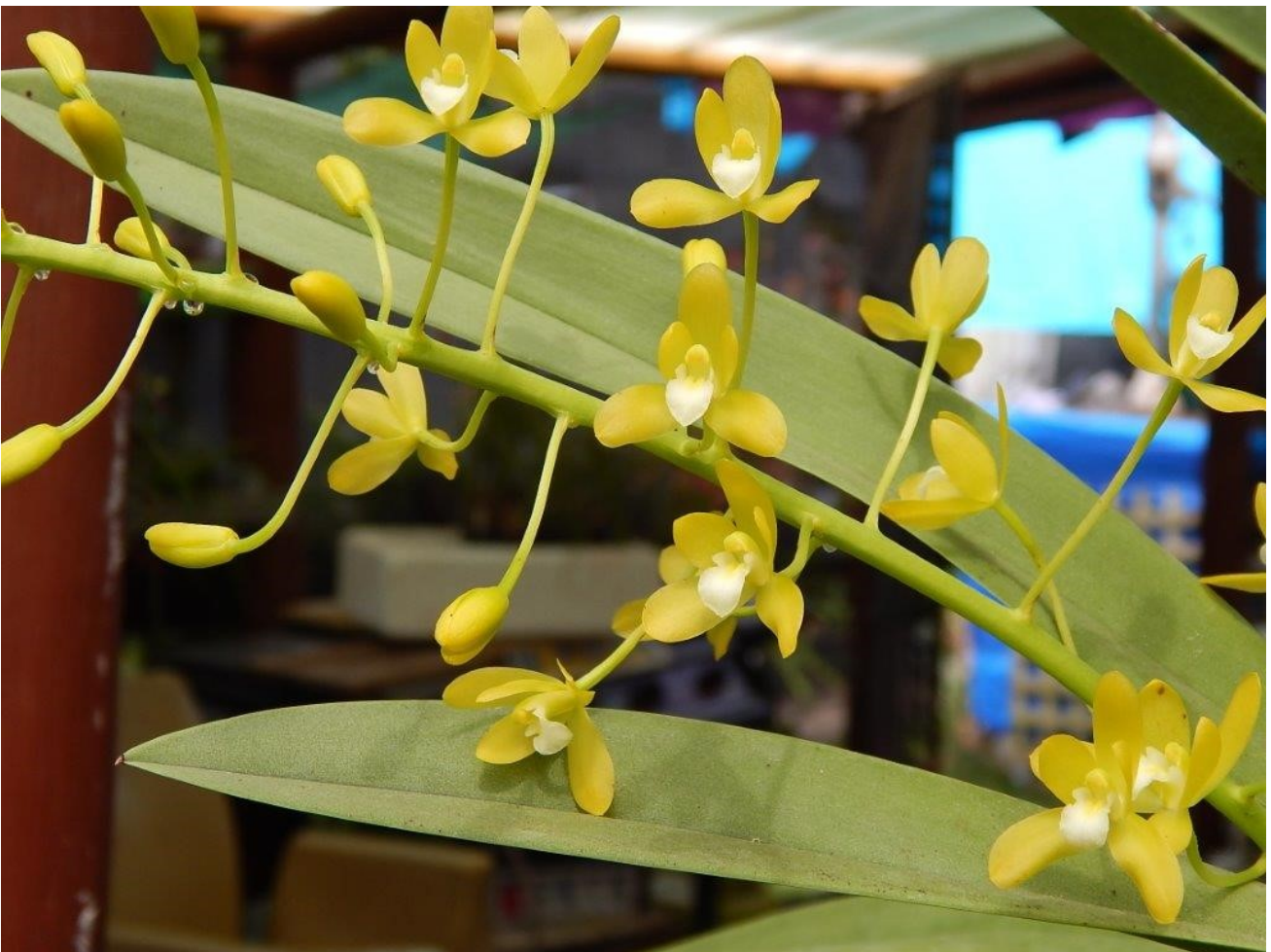
Last but certainly not least are the two alba forms of the species. Cym. canaliculatum has both a green and yellow alba form, as shown above.