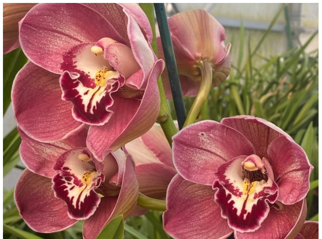
Top: Laramie Gold 'Golden Anniversary'; Middle: Khan Fury 'Dural' & (Amesbury X Masquerade) 'Green Passion'; Bottom: Laramie Lady 'Pastel' & Laramie Lady 'Coji Berry'.