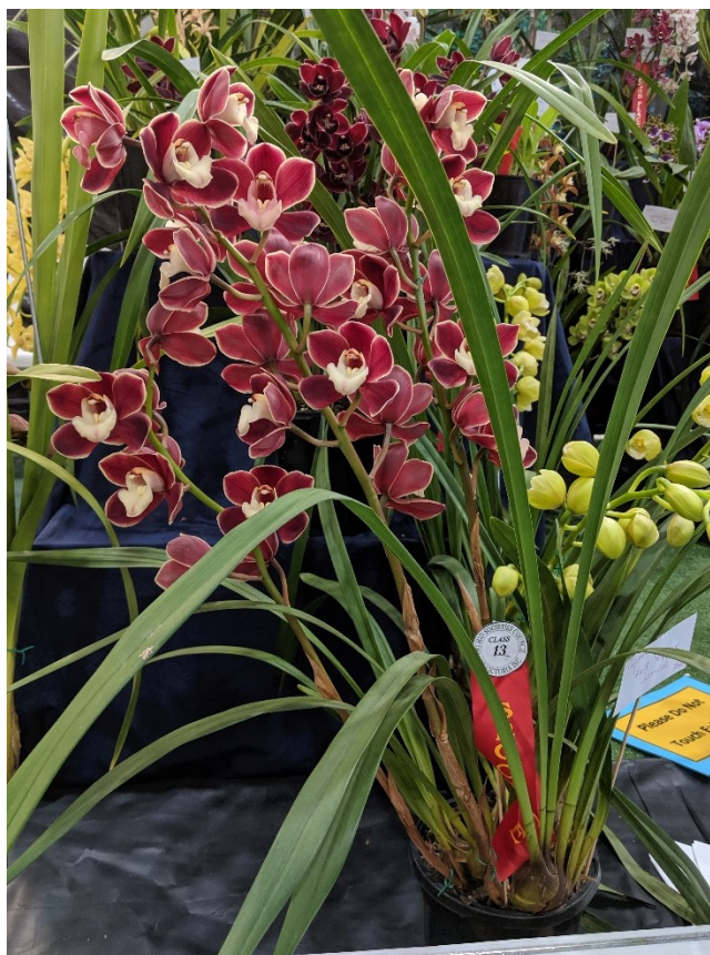
Red Pepper 'Janice' exhibited at the 2019 OSCOV show.

Kevin has also used Red Pepper 'Janice' in several crosses and unfortunately found that the pale labellum is not dominant – most seedlings he has flowered have had marked or strongly-coloured labellums. One of the few exceptions is a seedling of ((Nancy Quach X Beau Guest) X Red Pepper 'Janice'), which he has kindly provided photos of and are shown below.