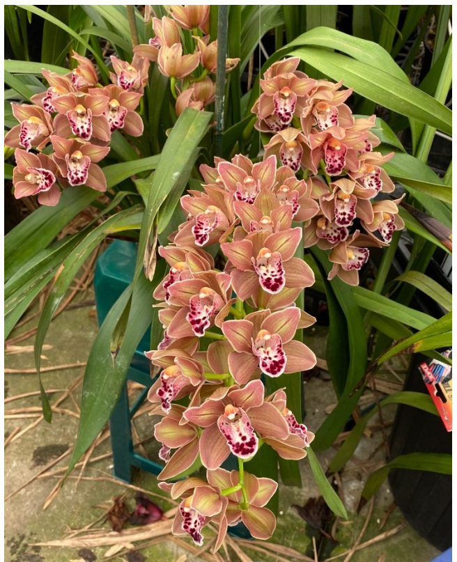
Top: Khanebono 'Jacinta'; Bottom: (Khanebono X Last Tango).