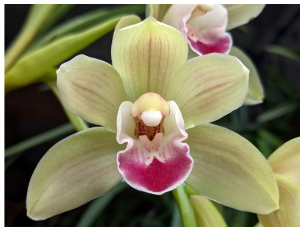
Cym. Pan Am Clipper, a long-lasting pendulous hybrid.