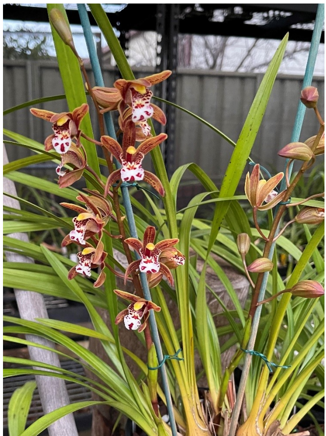
Ba Trieu = (Cym. erythraeum var. flavum 'Paradise' X Cym. floribundum var. album 'Peats Ridge')

My easiest Cymbidiums are the older type Cymbidiums like tracyanum and lowianum . My most challenging are the novelty orchids like