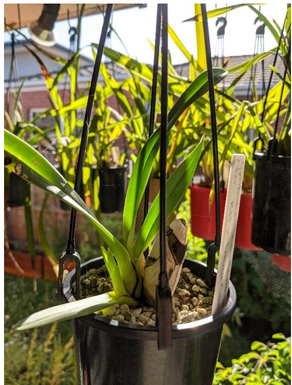
Even backbulb propagations of some of the rarer forms of Cym. canaliculatum can be expensive!