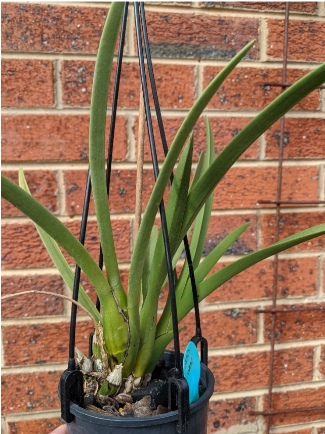
A flowering-size Cym. canaliculatum .

Cymbidium canaliculatum likes alkaline growing conditions. The application of a little lime, either by spray (1g CaCO 3 per litre four times a year covering the whole plant and media) or a small amount sprinkled on the media surface, during the growing season is very beneficial. Cym. canaliculatum