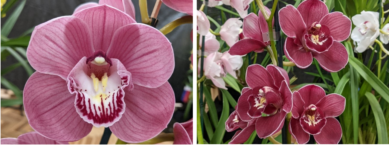
Cym. Blazing Beauty 1<sup>st</sup> Place in Class 20