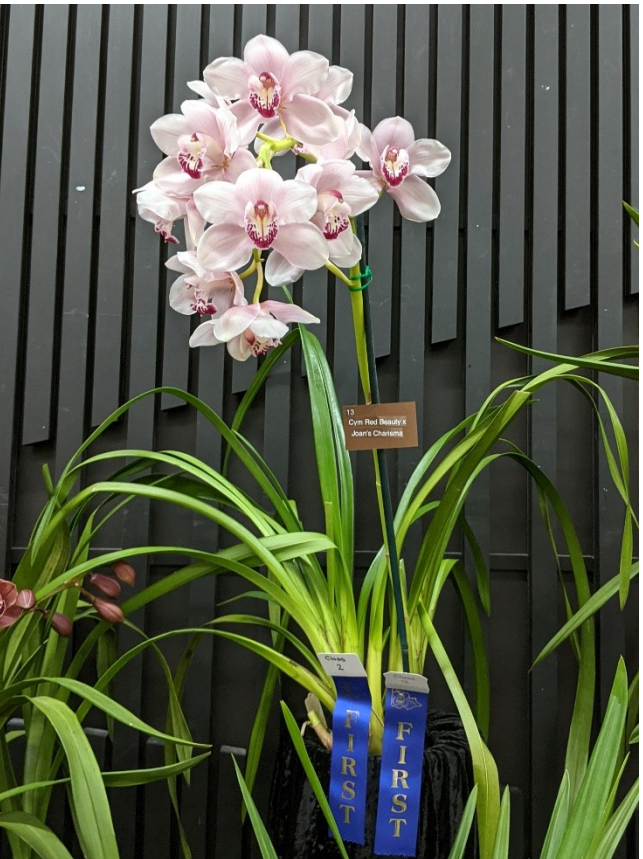
Cym. (Red Beauty X Joan's Charisma) 1<sup>st</sup> Place in Classes 2 and 12