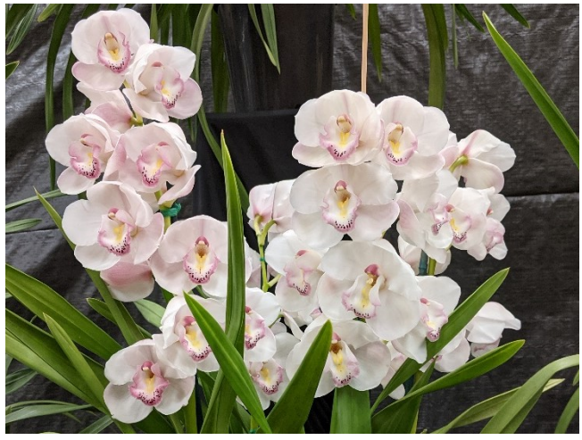
Cym. (Kuranulla 'Maestro' X Spring Flame 'Blushing') 1<sup>st</sup> Place in Class 16