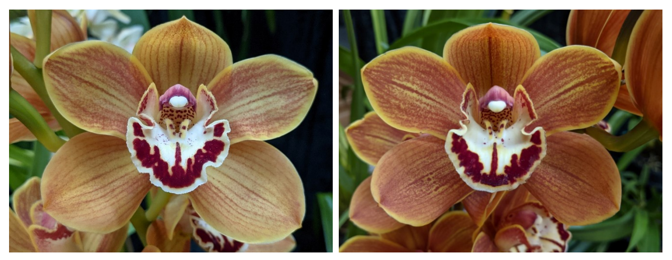
Two different divisions of Cym. Sundaani's Treasure 'Orange Crush'. One of these was 2<sup>nd</sup> Place in Class 23.