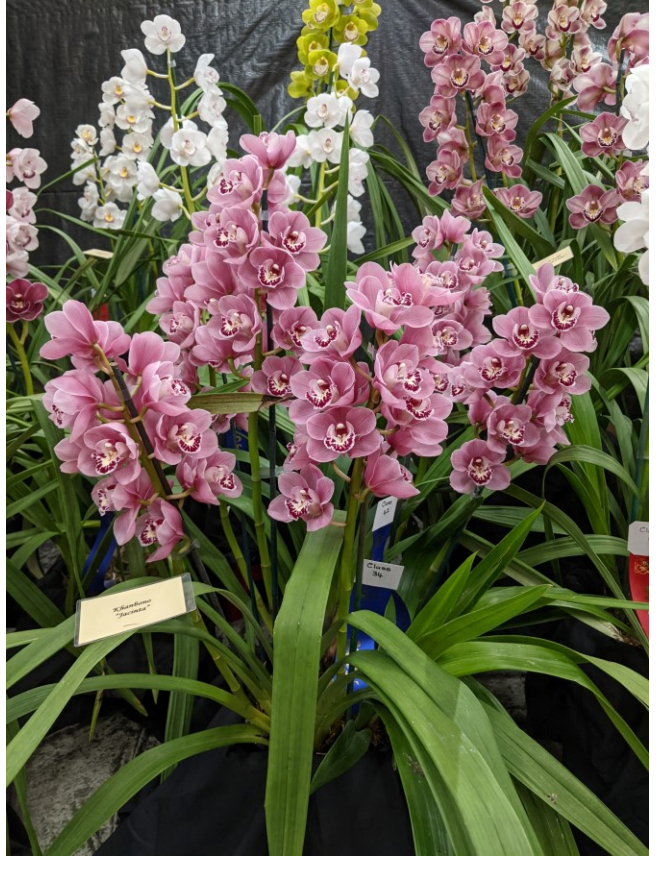
Cym. Khanebono 'Jacinta' Champion Intermediate and Champion Specimen