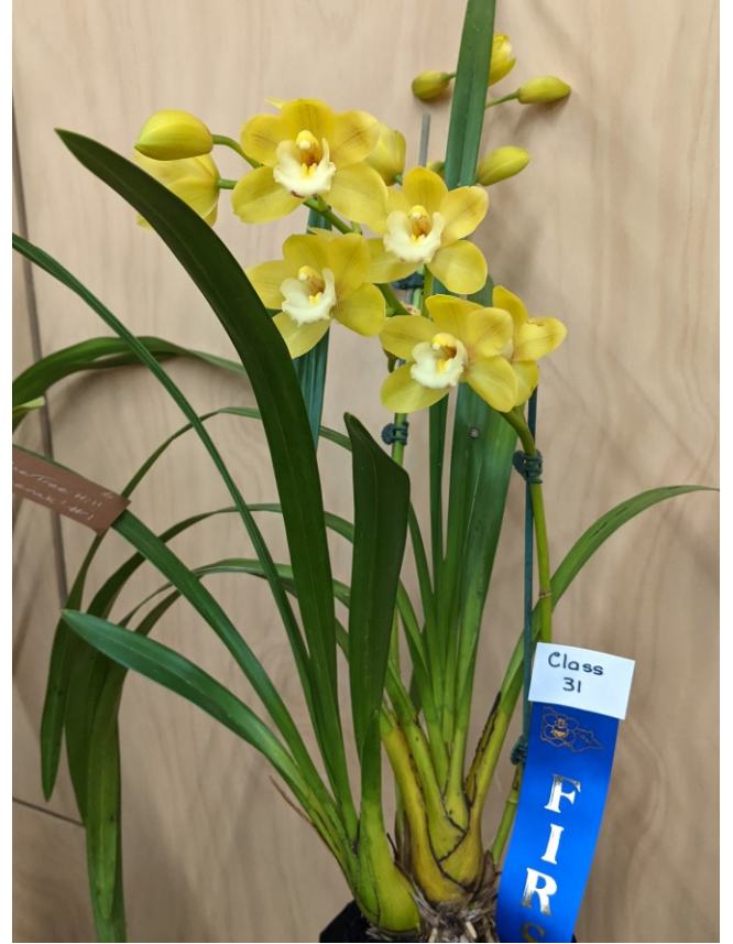
Cym. One Tree Hill 'Beenak' 1<sup>st</sup> Place in Class 31