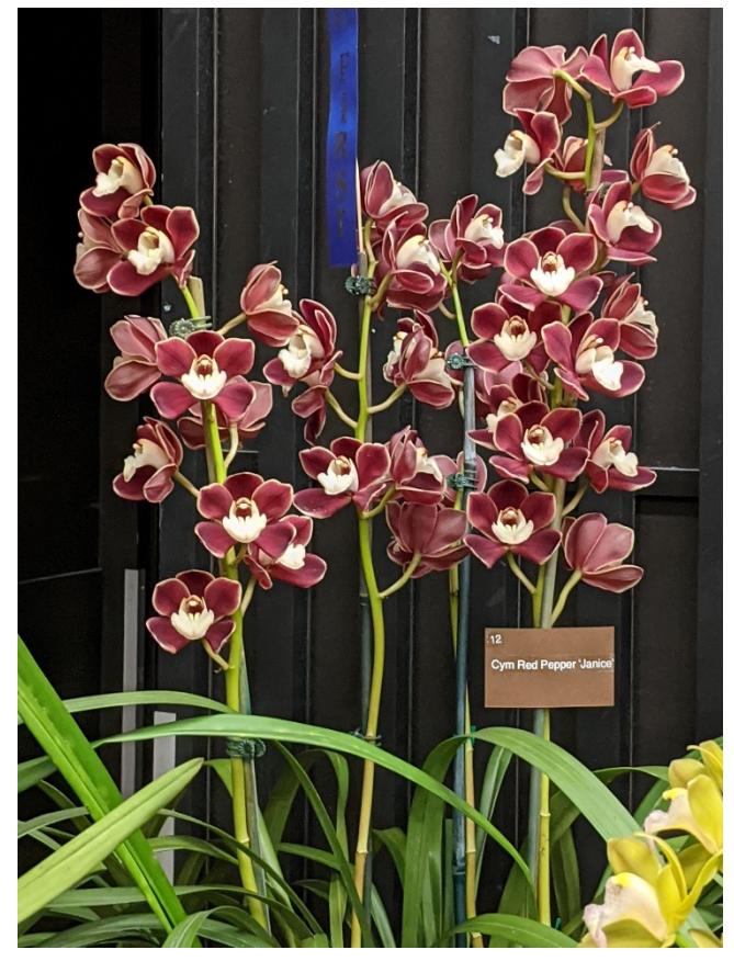
Cym. Red Pepper 'Janice' 1<sup>st</sup> Place in Class 37