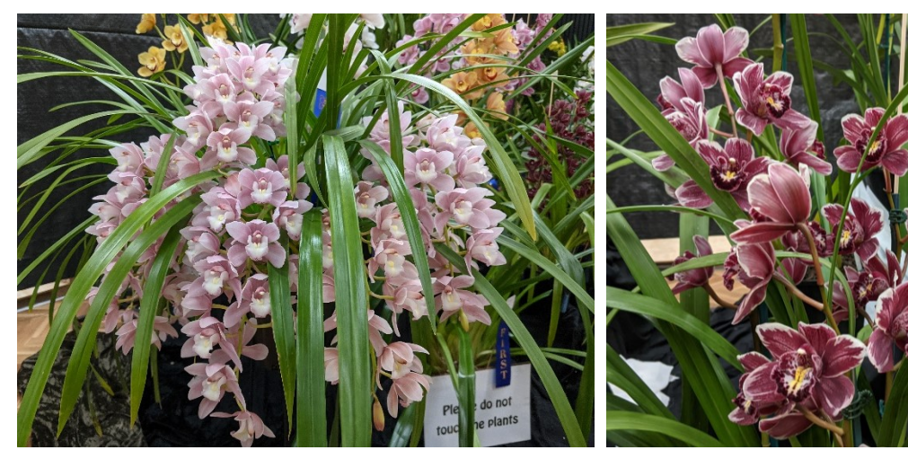
Cym. New Century 'Rosie' Champion Miniature