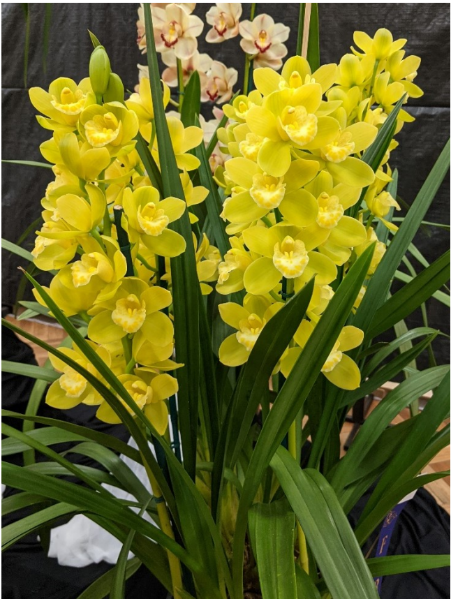
Cym. Blazing Dream 'HP' 1<sup>st</sup> Place in Class 33