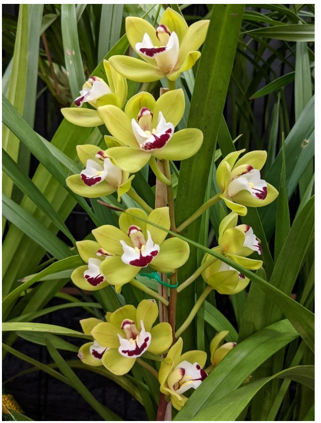
Cym. Thumbs Up 'Tamara' 2<sup>nd</sup> Place in Class 46