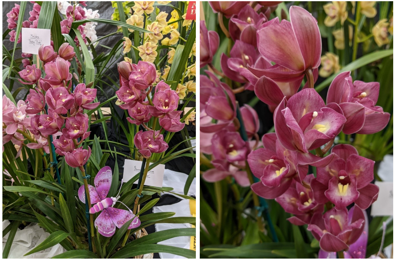
The unusual Cym. Sweet Wine 'Latour'.

The oddest Cym, in my opinion, was Cym. Sweet Wine 'Latour'. This petal peloric didn't even register as a Cymbidium when I first saw it out of the corner of my eye! (Full disclosure: I'm not a fan of most pelorics but recognise that they certainly get the attention of the public and that some people enjoy them.) To me, it was the most "novel" of the plants exhibited.