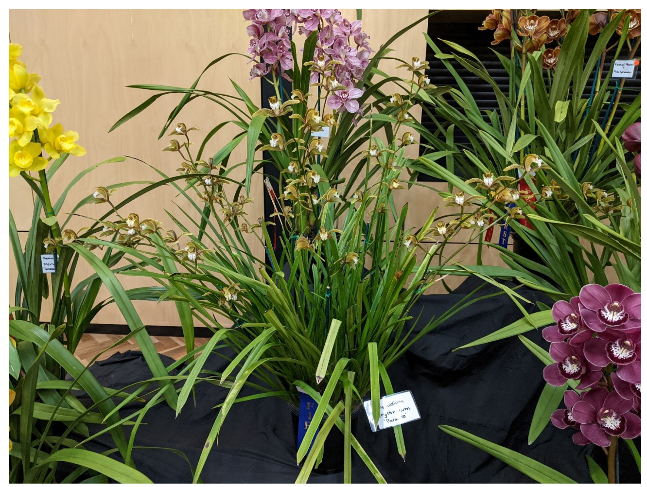
Cym. erythraeum var. flavum 'Paradise' Champion Species