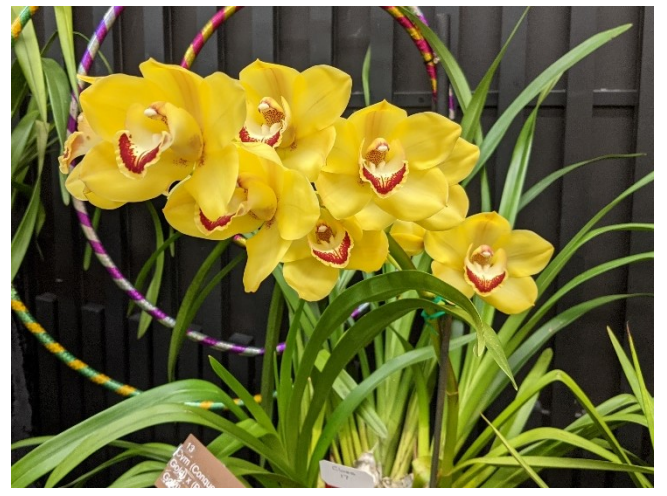
Cym. (Intense Gold 'Polaris' X Trinity Gold) 2<sup>nd</sup> Place in Class 17