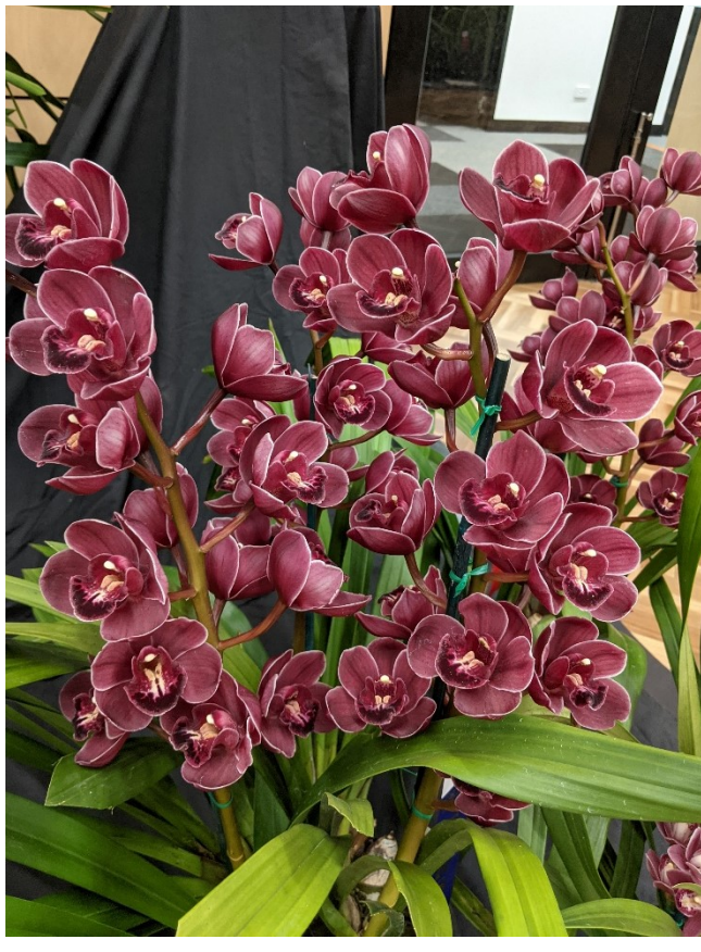
Cym. Nat's Pride 'No. 1' 1<sup>st</sup> Place in Class 35