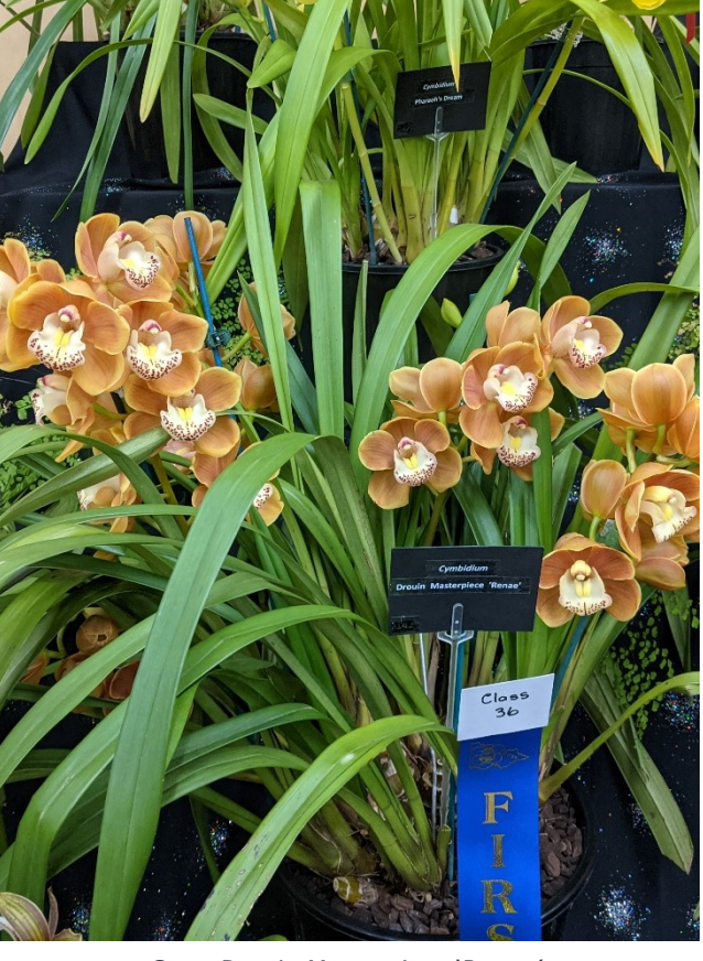
Cym. Drouin Masterpiece 'Renae' 1<sup>st</sup> Place in Class 36