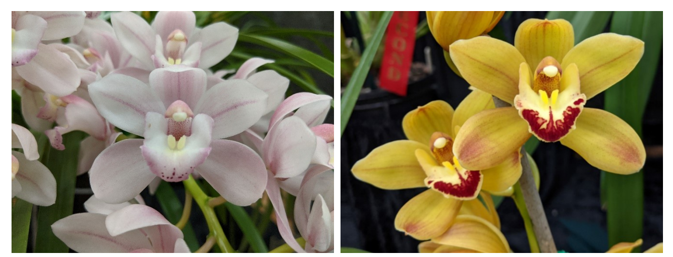
Cym. New Century 'Rosie Splash' 2<sup>nd</sup> Place in Class 44