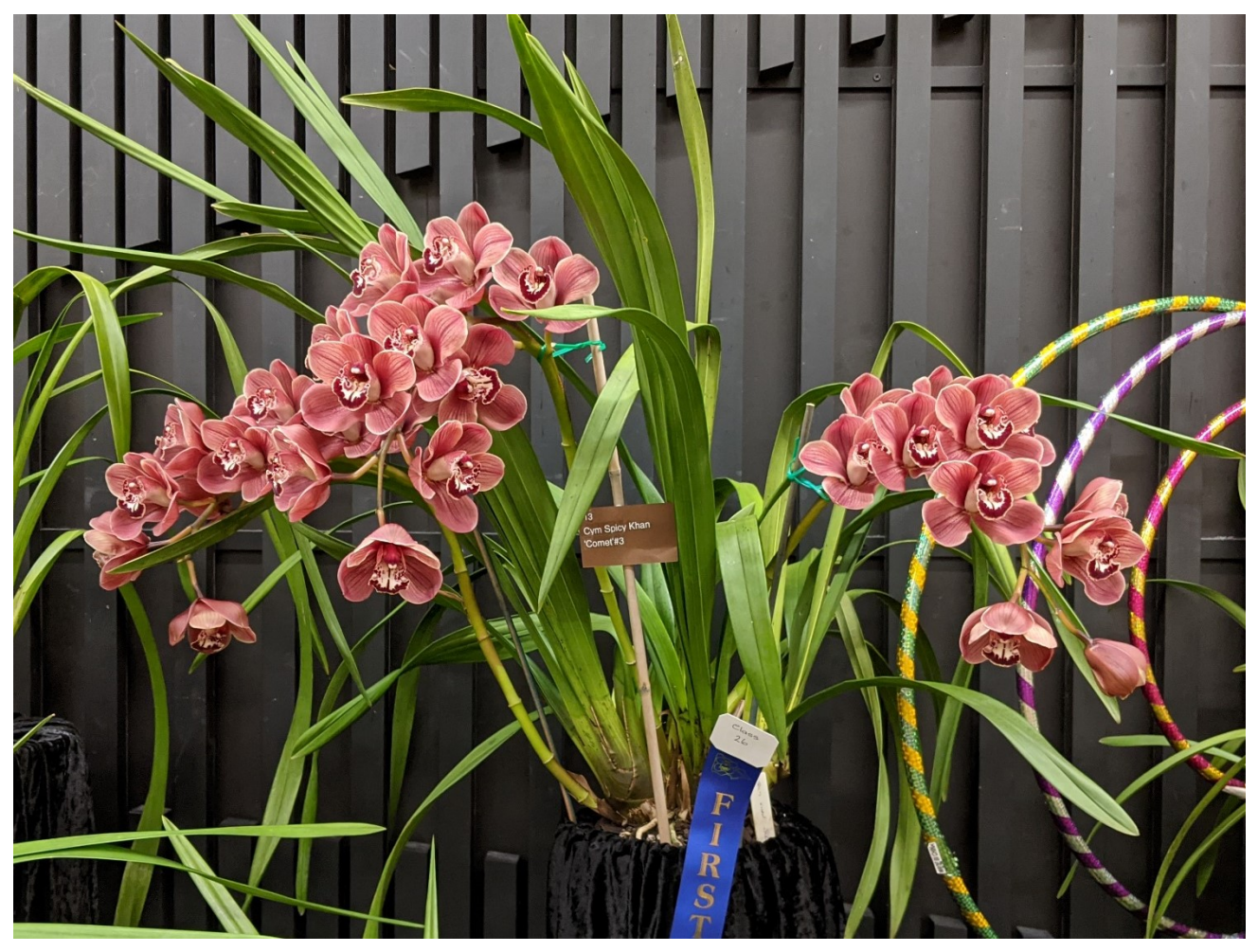
The larger of two divisions of Cym. Spicy Khan 'Comet' exhibited by Dennis Oliver 1^{\rm st} Place in Class 26

Non-alba yellows were in the definite minority at this year's show, with no large standards or miniatures entered for judging and only one intermediate – Cym. One Tree Hill, a well-known grex that is nearing 35 years old. In fact, there were more alba (aka "pure colour") yellows awarded than non-albas (alba yellow intermediates seems to be the most popular of the various yellows). Even browns and oranges, which can be finicky colours to produce, were more numerous.