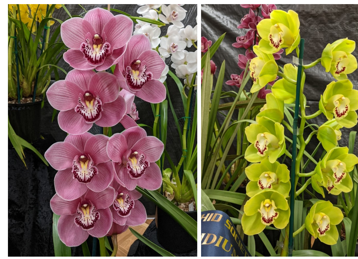
Cym. Regal Princess 'Bernice' Champion Large Flower