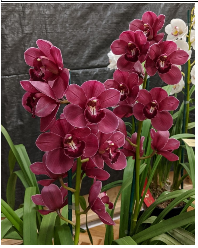
Cym. Regal Flames 'Queen of Hearts' 1<sup>st</sup> Place in Class 7