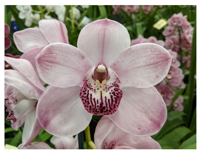
Cym. (Khan Flame X Kimberley Coast) 'Dusty Pink' 2<sup>nd</sup> Place in Class 10