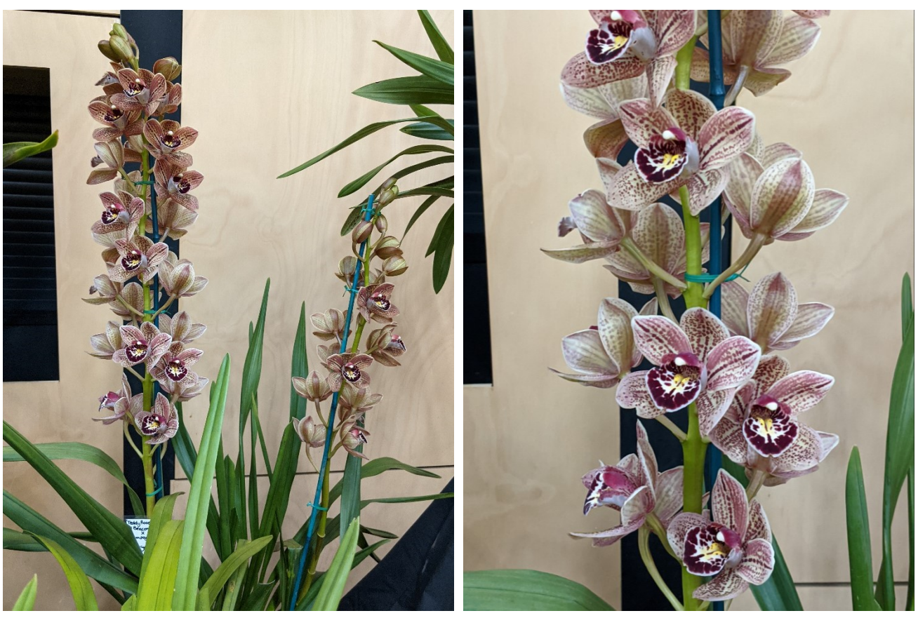
Cym. ((Teddy Roosevelt x Beaconfire) X Champagne Robin) 'Royale' 1<sup>st</sup> Place in Class 38