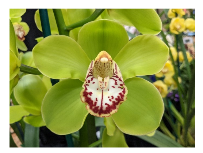
Cym. Kimberley Lagoon 'Argyle' 2<sup>nd</sup> Place in Class 4