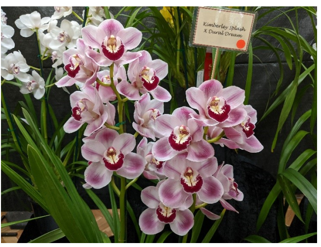
Cym. (Kimberley Splash X Dural Dream) 1<sup>st</sup> Place in Classes 13 and 24