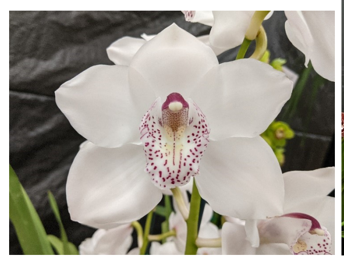
Cym. Kulnura Venus 1<sup>st</sup> Place in Class 1

Sadly, examples in these latter two classes were particularly lacking, with only one of each exhibited. The full results from the show are provided over the next few pages.